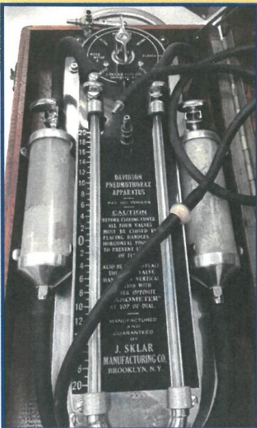
Instrument for treatment of a collapsed lung.